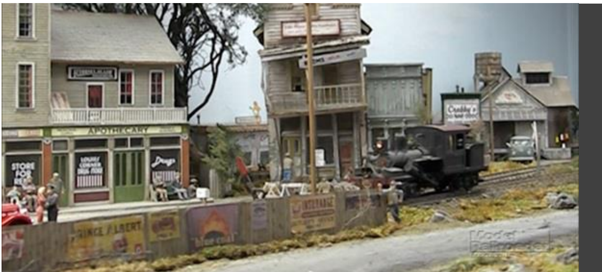
A Climax runs along the main line on Tom Staton's On3 Narragansett RR model train layout.