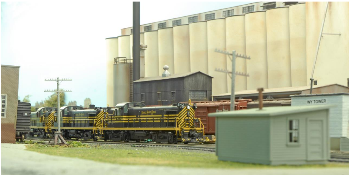
Almost new Alco RS-3s inbound from the dieselized Peoria Division ease into Frankfort, Indiana's eastbound yard as they pass the busy Swift soybean plant and WY Tower. The St. Louis Division won't be dieselized with Geeps and RS-3s until next summer.