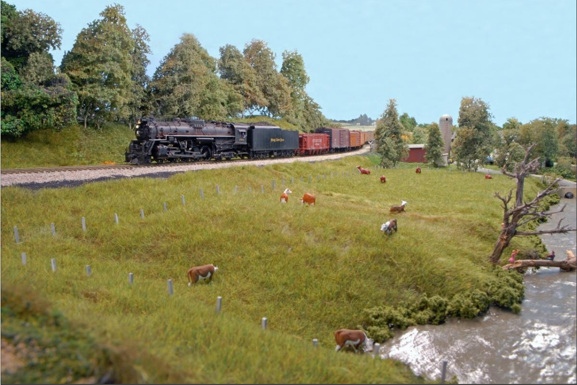
Nickel Plate's first Berkshire, Alco-built no. 700, heads west between Frankfort and Linden, Indiana, with a fast freight destined for St. Louis in the autumn of 1954.