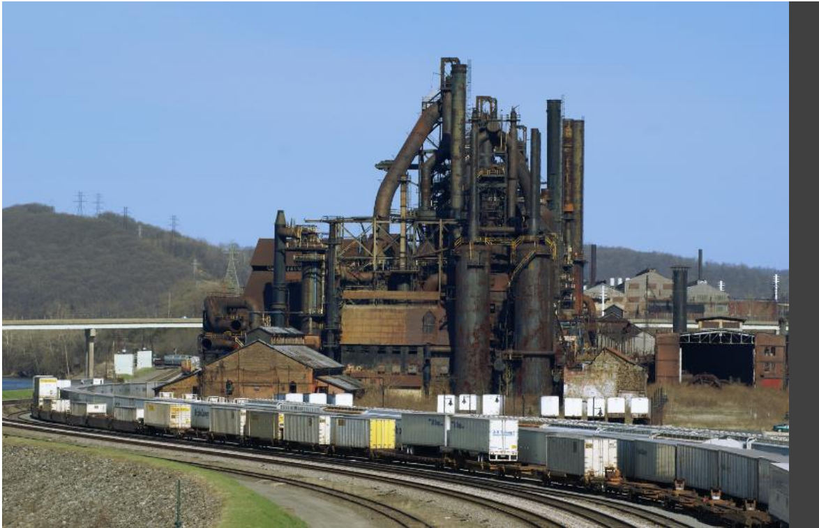
Bethlehem Steel, Bethlehem, PA